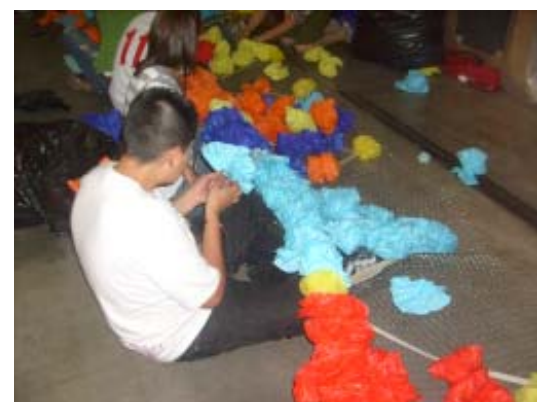
Freshmen working hard to make their float top-notch

Two weeks of flower making and construction are necessary in order to have the floats ready for homecoming night. On top of all the floats, there is royalty, putting on a great halftime show, etc. None of this could be achievable without the time and endeavors everyone puts into this as a team. So instead of wasting time find a way to wreck one another's floats, we can use that time on more important subjects like actually making the flowers and doing everything that needs to be done that way there are no last minute emergencies the day of the parade and football. It is not necessary to trash each others floats. We all at one time were or are freshmen, sophomores, juniors or seniors. Let's not take the chance of losing this unique event we have had every year. Instead, let's make the most of this occasion that no other school has the advantage to experience.