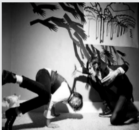
The boys from 3Oh! 3 show us their moves