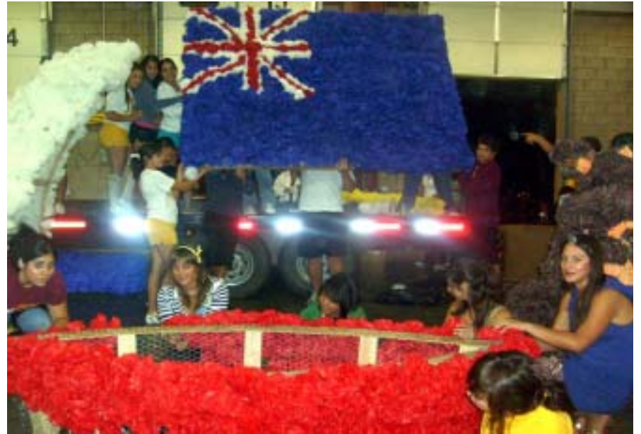
The juniors are ahead of the game with their float representing Australia. Parents, students and sponsors work together to make this a memorable homecoming.