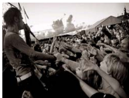
Rock out this fall

Those are a few of a concerts coming to Tucson, one hour away from your favorite bands! Go and enjoy, maybe even meet some nice people, you're bound to have something in common!