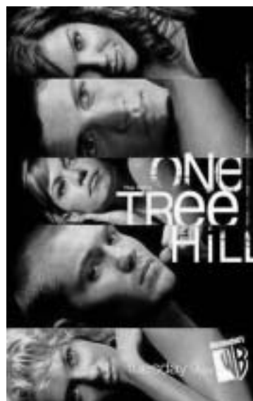
Has “One Tree Hill” gone downhill?

If I wanted more of the same drama I’d watch some Young and the Restless . If you want a good show, go rent the first season of One Tree Hill . I know I won’t waste my time watching the rest of the sixth season of the dim-witted drama fest One Tree Hill has become.