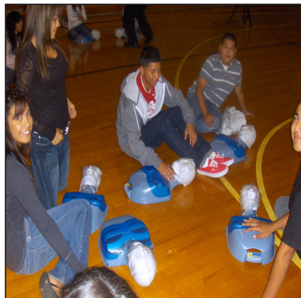
Students excited to learn the practice of CPR

Ahh... doesn't it feel nice to have so many certified people on campus? Now, we can all choke freely. No need to be afraid of death, a freshman will rush in to save you...hopefully.