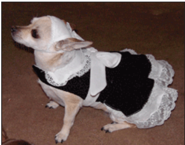
Even family pets are getting in on the naughty trend.