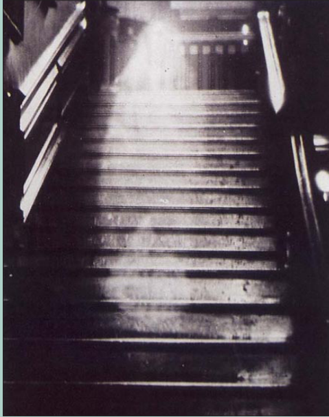
Proof, or a badly-developed photo?

People think that when they hear these stories they are being fooled or that the storyteller is insane. This might be true, with all those fake ghost stories people hear about and can't get over, or those lame pictures with a "shadow" or "image" of someone somewhere that have been passed around on the web. Just know that sometimes when a person dies in a certain place, it wasn't their chosen place to die. Obviously you can't choose your destination, whatever it may be, so what is left to do for that soul but to linger on the place where their life was taken away?