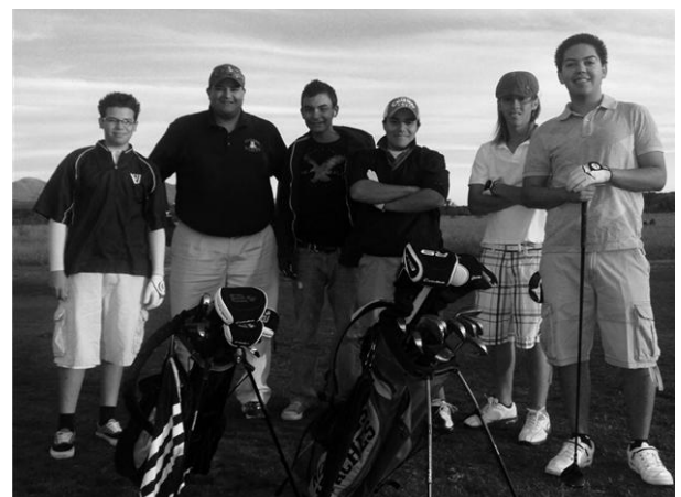
A hole in one for golf!

Victory after victory, the golf team seemed to have had Lady Luck on their side during mid-October. Winning three games within two weeks was a major