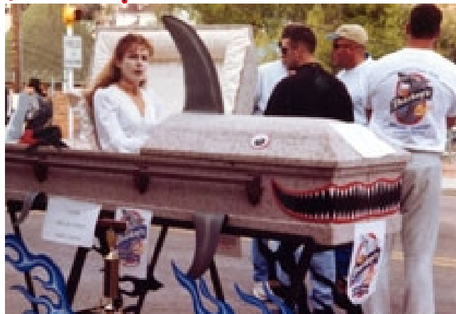
That's a nice coffin!

Prizes are given for the fastest coffin, the most creative costume and the best "Emma".