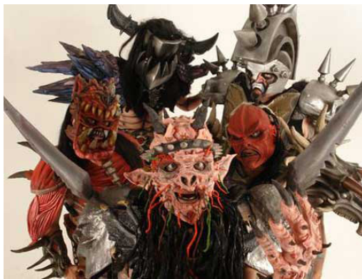
GWAR will eat your car!

Marilyn Manson, Slipknot, and Cradle of Filth are some examples of outrageous fashion statements. Manson has gone from latex onesies to all-black suits. Slipknot chooses to hide their faces behind crazy masks with eerie designs to them. As for Cradle of Filth, they like their gothic clothing and make-up look. Sadly, neither of these come close to the Norwegian death metal band Dimmu Borgir.