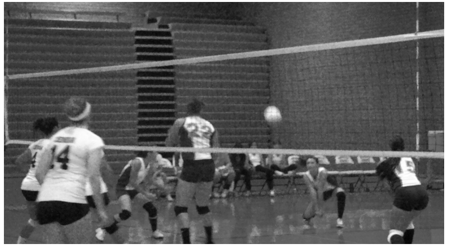
The Lady Apaches defend their honor against Desert View