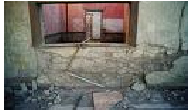
This is one of the rooms inside the abandoned adobe house at Guevavi Ranch