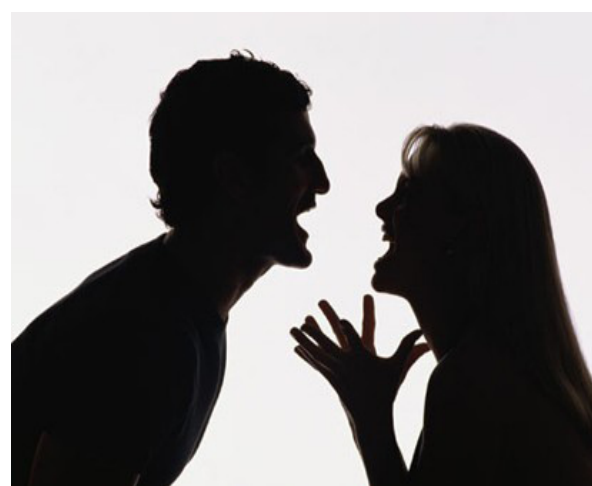
CAPTION CAPTION CAPTION

Many students are getting hurt and in trouble just because they can't control their anger. Someone needs to put a stop to this!