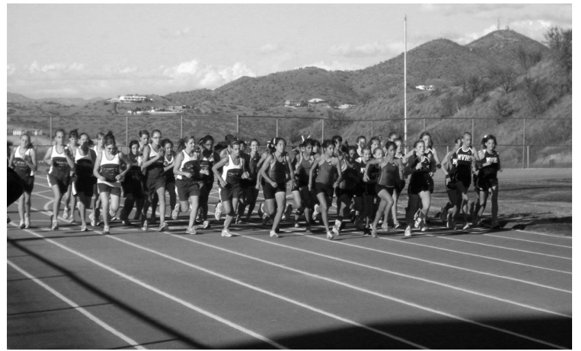
The Cross Country team races to the finish

While they won't be caught bragging in school, the NHS runners still walk around campus with their heads held